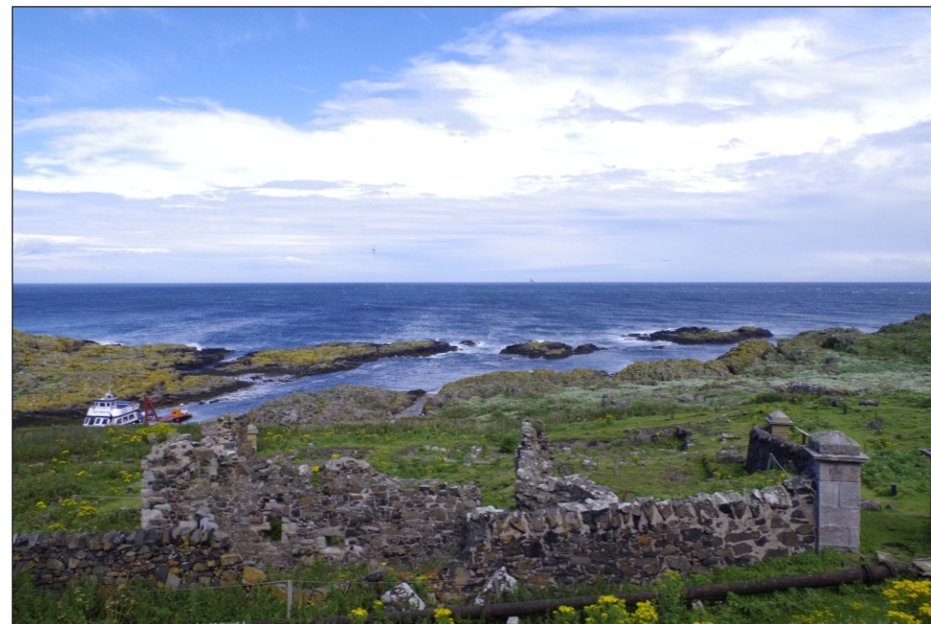
The setting of the Isle of May Priory (SM883), facing east towards the Offshore Wind Farm

Cumulative wireline and Photomontage from Isle of May looking towards the Offshore Wind Farm