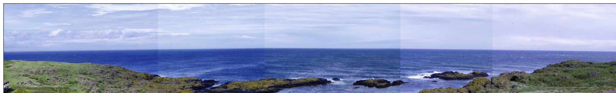
Panorama from Isle of May Priory (SM883), looking east towards the Offshore Wind Farm

Please note, this visualisation is reproduced here for comparison purposes only. It is not to scale and does not comply with the presentation guidance in Scottish Natural Heritage's Visual Representation of Wind Farms Guidance v2.2 (2017). The original visualisations, presented in line with this guidance are available in the EIA Report Appendix 3.